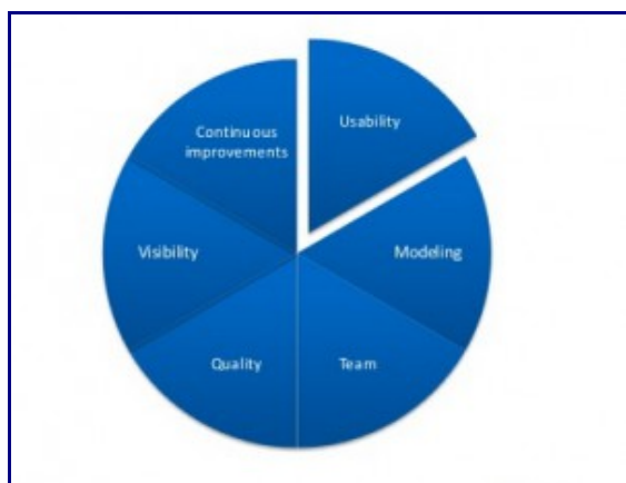
Continuous improvement in the office, 12 aprilie