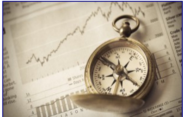
Influencing virtual teams, 16-17 martie