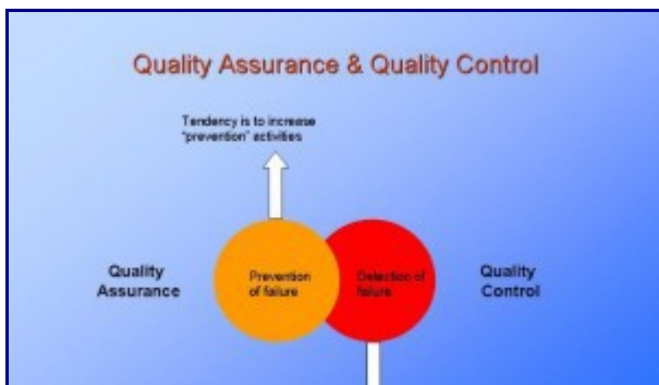
Quality Core Tools, 28-31 martie