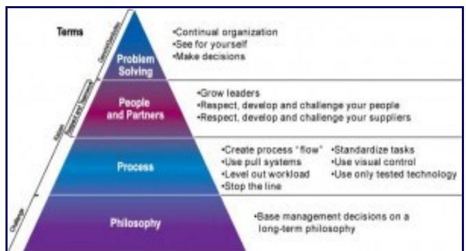
Toyota Management Principles, 7-8 aprilie